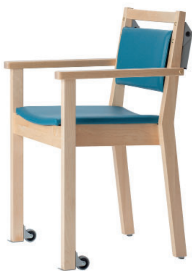
O152H Oiva chair, with nursing equipment