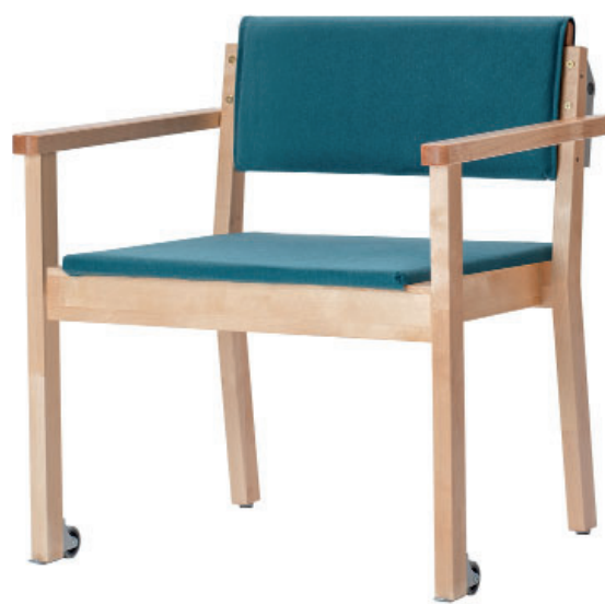
O165H Oiva chair, with nursing equipment, wide seat