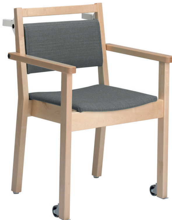
O152H Oiva chair, nursing equipment