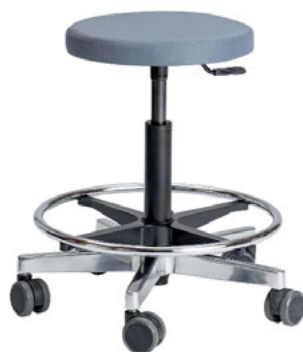
O511V Onni office chair with footrest, Upholstered padded seat