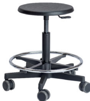
O510P Onni office chair with footrest, soft PU seat (P)