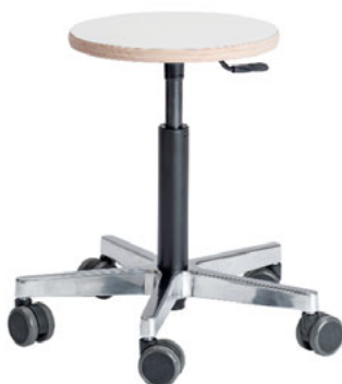
O506L Onni office chair, Laminate seat