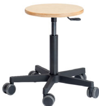
O505 Onni office chair, plywood seat