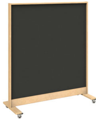
V25-L Screen, chalkboard