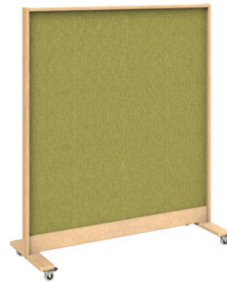
V21-V Screen, upholstered