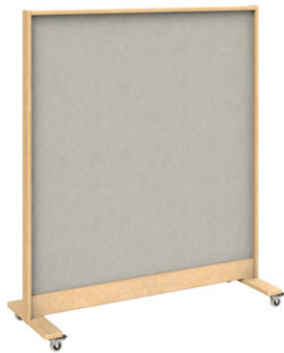
V25-H Screen, felt