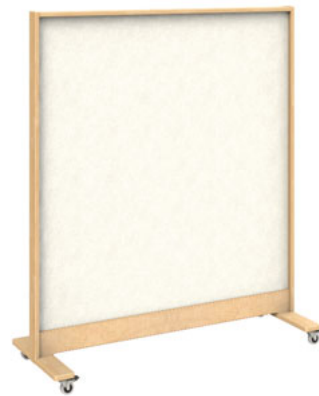
V25-M Screen, magnetic whiteboard