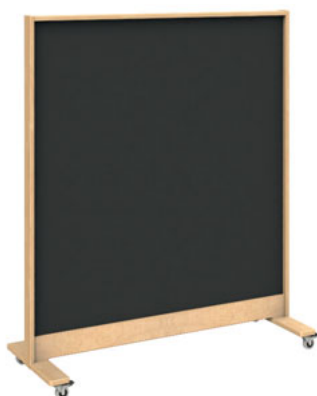
V25-L Screen, chalkboard