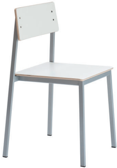
OM100 Stackable Onni chair, with metal legs