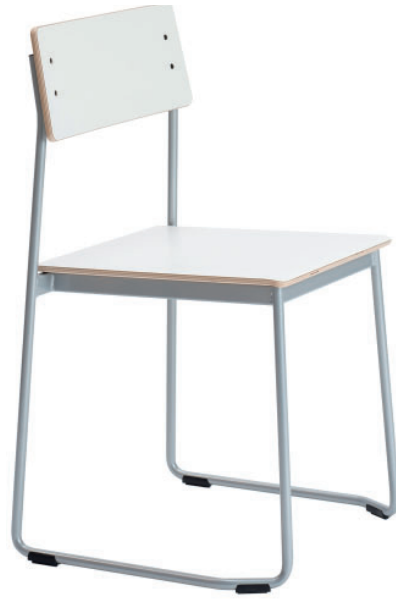
OM110 Stackable Onni chair, with looped metal legs