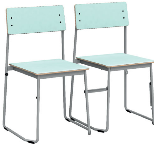
OM110-R Stackable Onni chair, with looped metal legs and row linking